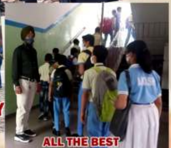
ALL THE BEST