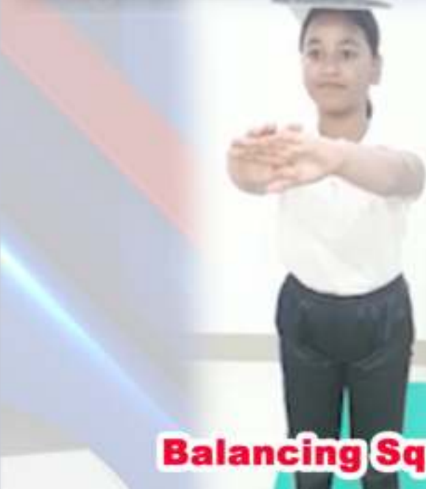
Balancing Squats, Std : VI to VIII