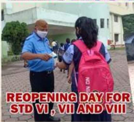
REOPENING DAY FOR STD VI, VII AND VIII