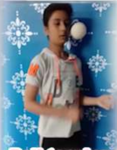
Ball tapping with Fist, Std : VI to VIII

Sports is a way of life at JSSP . Students of UKG to Std VIII participated in a plethora of challenges given by the coaches in ENERGIA 2.0 - A Virtual Sports Fest .