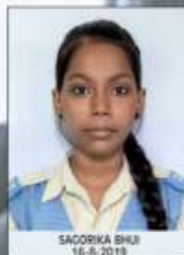
SADORIKA BHU 16-8-2019