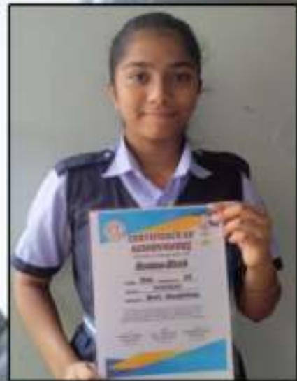
Suvarna Shruti 3rd Prize 14-16 years age group