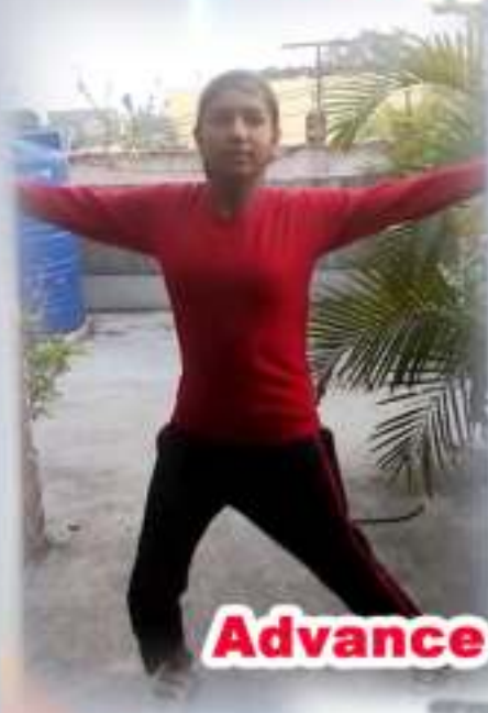
Advance Jumping Jack, Std : VI to VIII