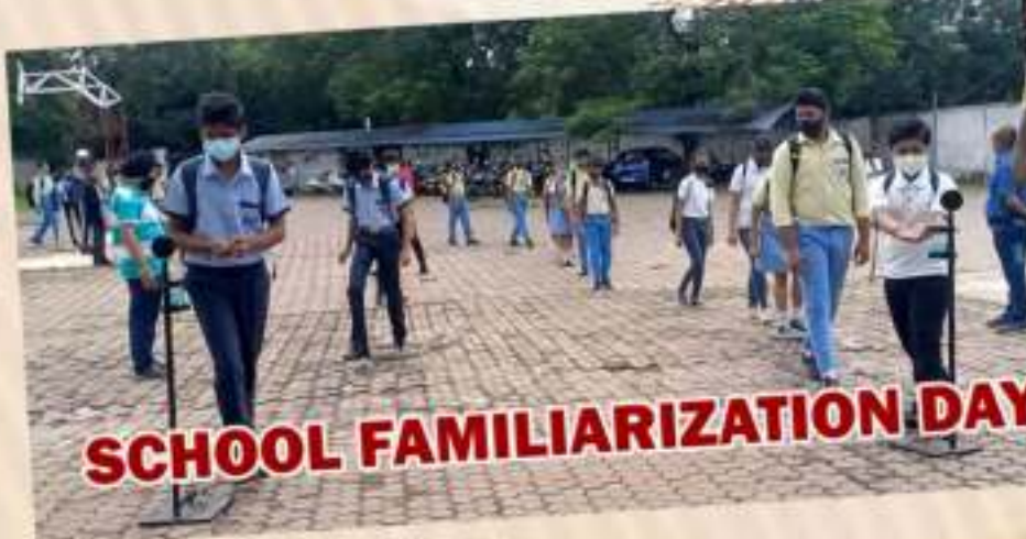
SCHOOL FAMILIARIZATION DAY