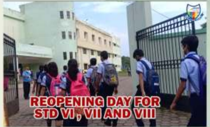
REOPENING DAY FOR STD VI, VII AND VIII