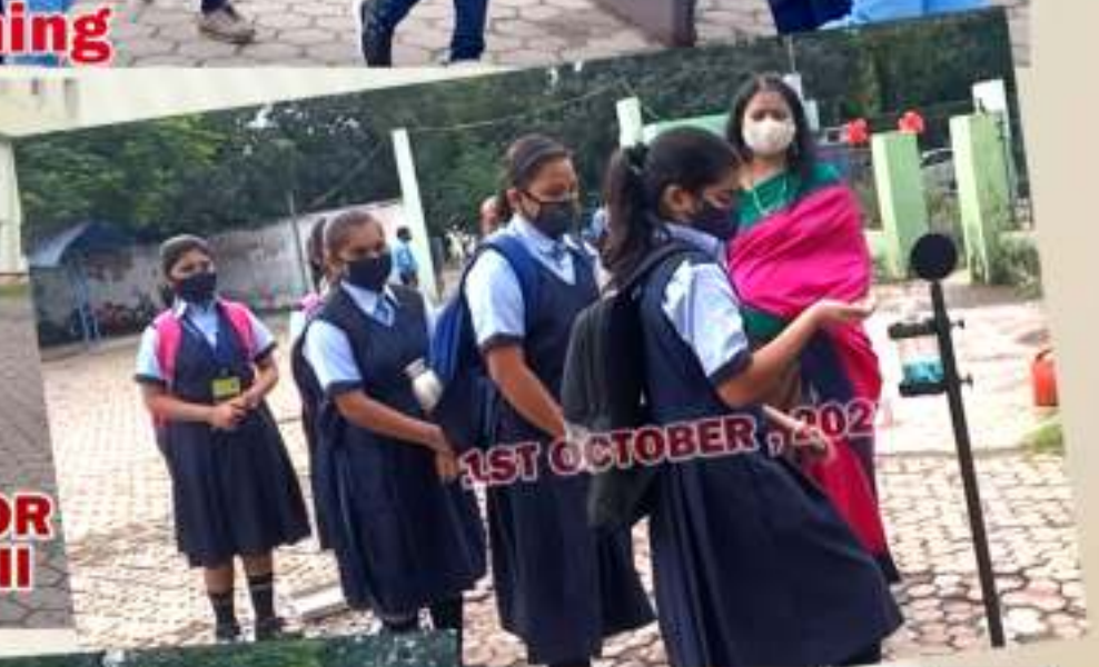
1ST OCTOBER, 2022